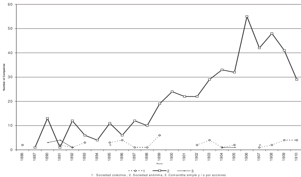
Graph 2. Foreign companies. Registered in Mexico City, 1886-1910